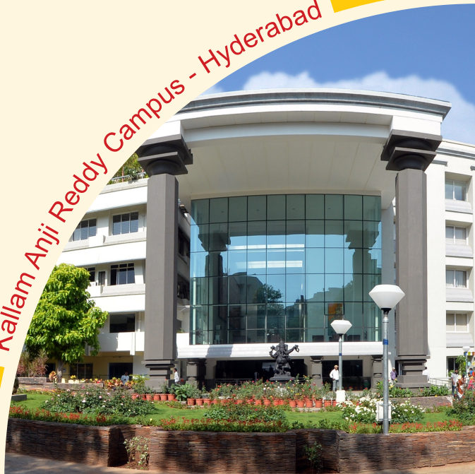
Kallam Anji Reddy Campus - Hyderabad