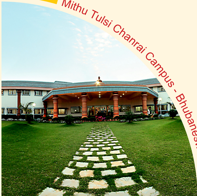
Mithu Tulsi Chanrai Campus - Bhubaneswar