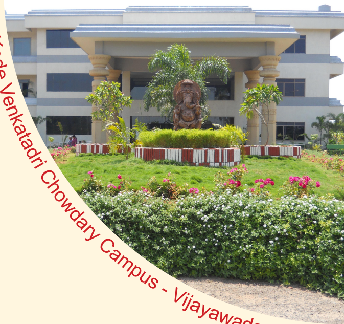
Kode Venkatadri Chowdary Campus - Vijayawada